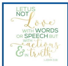
Casting Vision 2021