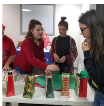
Unity in Community